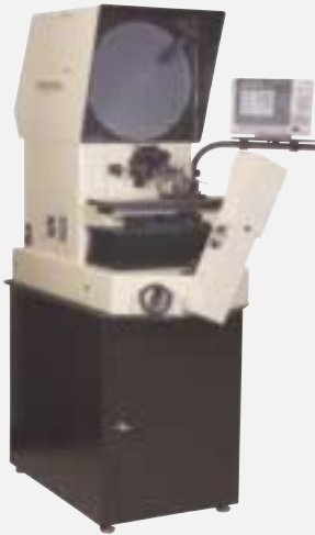
Shown above, 20-3700-03 on Heavy Duty Console Base and with Lamphouse tilted to one side.