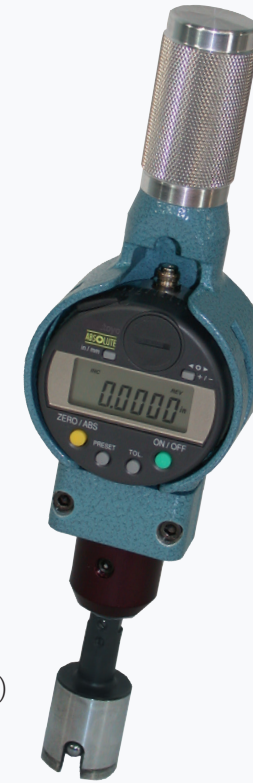
Part# DX4-81037 Digital indicator housing (indicator not included)