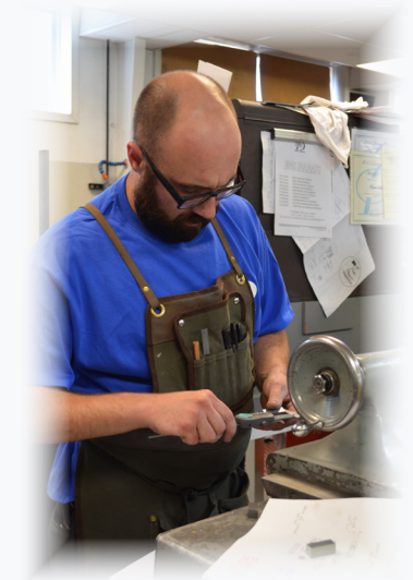
Dorsey Products - proudly made in the USA