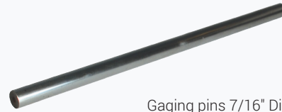
Gaging pins 7/16" Dia.