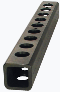
1.5" x 1.5" Heavy Duty tube 3.5 lbs per ft.